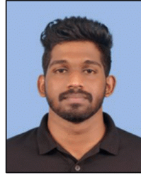
210864M RAJAMANTHRI RRPWGUD