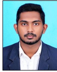
210888N WEERALAL JLSG