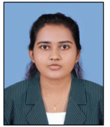
210848T MADHUMALI MHD