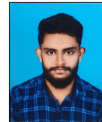
210859D PERERA WANK