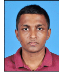
210805K AMARAWANSHA WKT