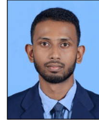
210816U CHARUKA MGK