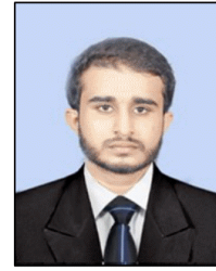
210889T WELLAPPILI C.A.