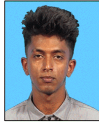
210834X INTHujan I