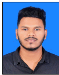
210870D SAMIDON MA