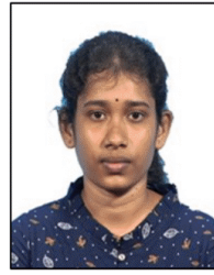
210875X SHAMBAVY R