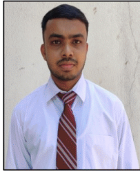
210802A AKSHAN DN