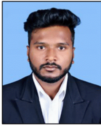
210832N HERATH HMCg