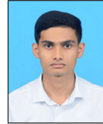
210811B ARUNODA SJMA