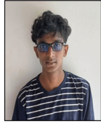
210809C ARACHCHIGE VGW