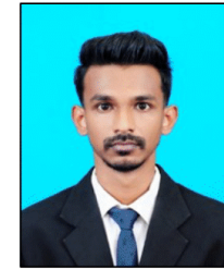
210817A CHATHURANGA WAR