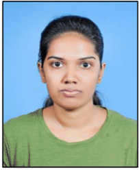
210813H BANDARA BPNL