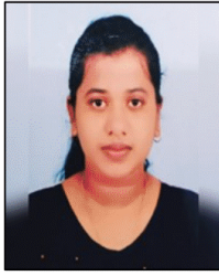
210886G VITHURSANA S