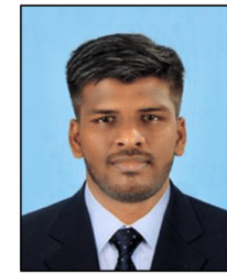
210823M DINESIOUS A