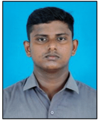
210843A KISHOPAN M