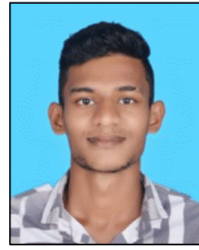
210876C SILVA HYSL