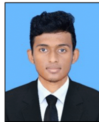
210858A PERERA UPD