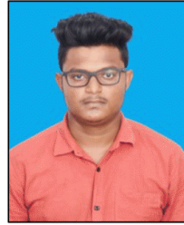
210814L BANDARA IDN