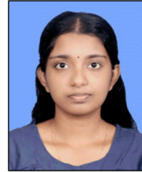
210810V ARANI T