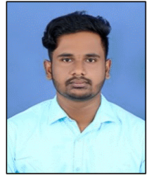
210812E ATUJAN N