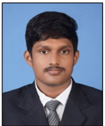
210855L NANDANA HPY