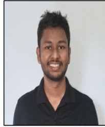
210815P BELPAGE CJ