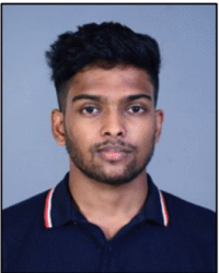
210885D UNAWATUNA UHDW