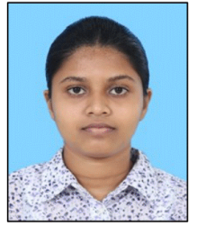
210806N AMBEPITIYA CAH