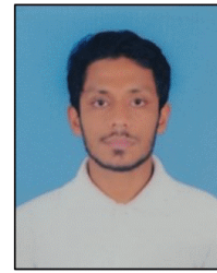
210883U UDAWATTHA IAD