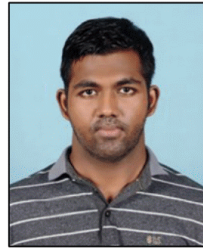
210833T IKSURA MPA