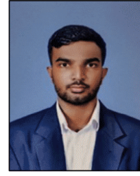
210865R RAJAPAKSHA RMNP