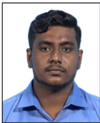
210856P PAMITHAN K