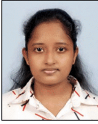
210862F PREMARATHNE KADK