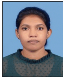
210851V MANAWADUGE DI