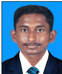
210826B FASHAHIR ARM