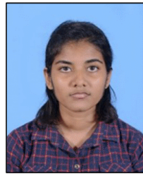
210845G KUMARI HMMK