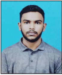
210801U ABERATHNE MRSN