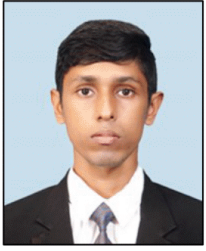
210831K HASHAN NBR