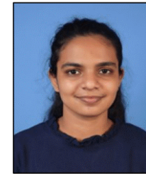
210829L GURUGE UN