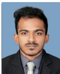
190827B PERERA M.T.R.D