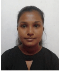
190839M WASANA N.W.A.P