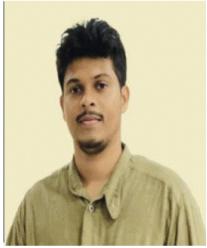
170802C APPUHAMY R.P.M.C