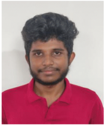
190832K SARANGA K.H.G.R