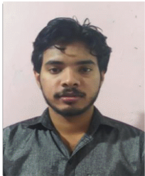
190815L ISURANGA S.P.G.C.