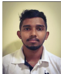
190816P JAYAKODY J.A.N.S