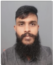
190807N BANDARA R.G.T.I