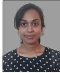
190835X SILVA S.A.V.