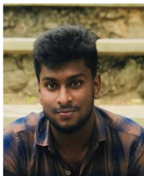
190821C LOKUGAMHEVA S.W