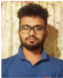
190829H RATHNAPRIYA R.H.D.L