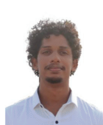
190824M MADURANGA U.K.D