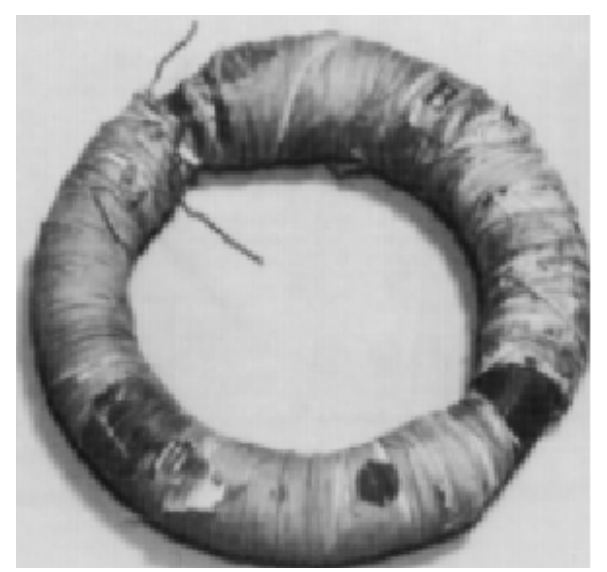
Figure 2.1 - Faraday's first transformer

In recent past, there is a considerable interest in employing switching controllers to control nonlinear systems, for which conventional controllers cannot especially meet the demand [47]–[53]. Basically, there are two kinds of switching schemes: Direct switching: the choice of when to switch to the next controller, in predetermined sequence, is based directly on the output of the plant. Indirect switching: multiple models are used to determine both when and to which controller one should switch.