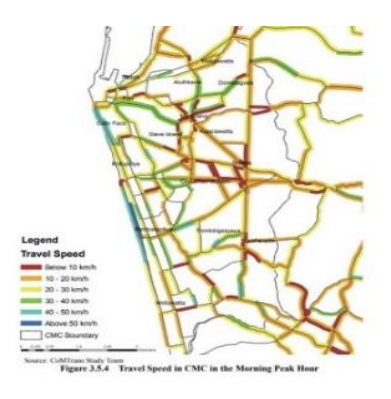
Figure 1: Average Speeds of Morning Peak (CoMTrans Study)

In practical scenario, inside Western Province most inter provincial buses do not allow the riders riding for a short distance to board the bus. Instead they are required to take the intra provincial bus. However, as the inter provincial buses travel faster than the intra provincial buses within the Western Province too, the google will indicate the inter provincial bus as the preferred best route. User is misguided.