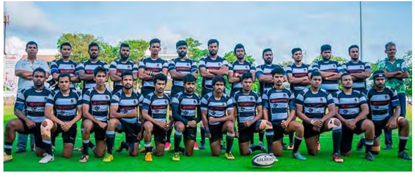
The University Rugby football Team performed an excellent way. They beat University of Peradeniya in the grand finals with 40-24 at Race course ground on 09th September 2018.

The University of Moratuwa won nine Inter University Championships of Rugby football (Men), Rowing (Men), Carrom (Men), Badminton (Men), Taekwondo (Men & Women), Table Tennis (Men & Women), and Hockey (Women).