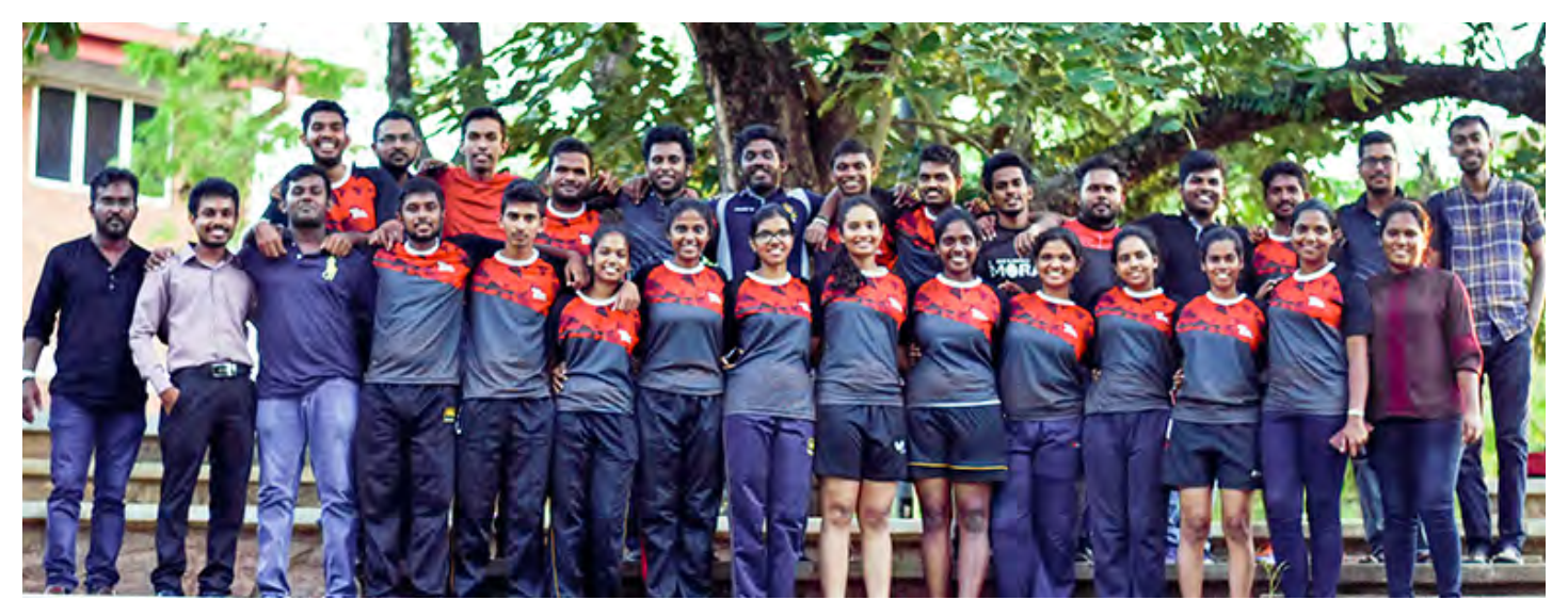
The Table Tennis (Men & Women) Teams won both Championships at New Gymnasium University of Moratuwa on 08^{th} & 09^{th} September 2018.