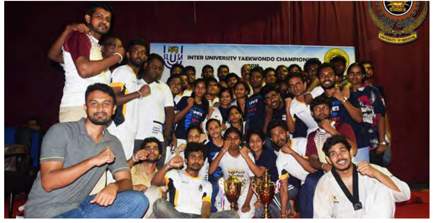
The Taekwondo (Men & Women) Teams won both Championships at University of Kelaniya on 29th & 30th September 2018.