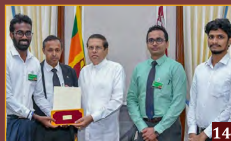
SiTa Wins Award