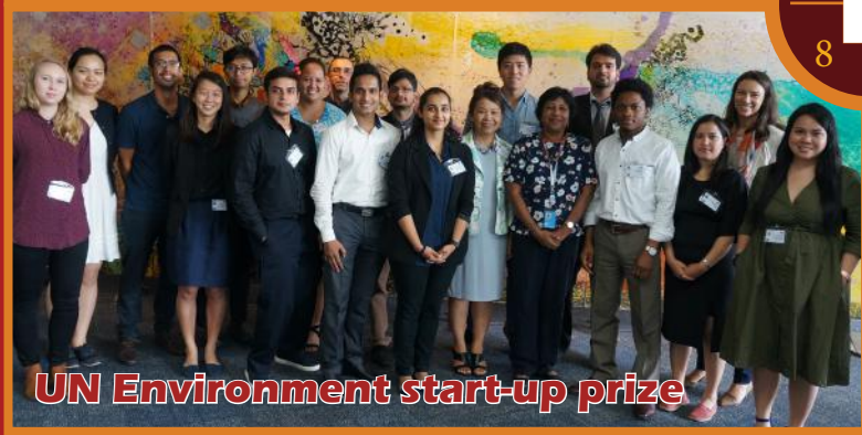
UN Environment start-up prize