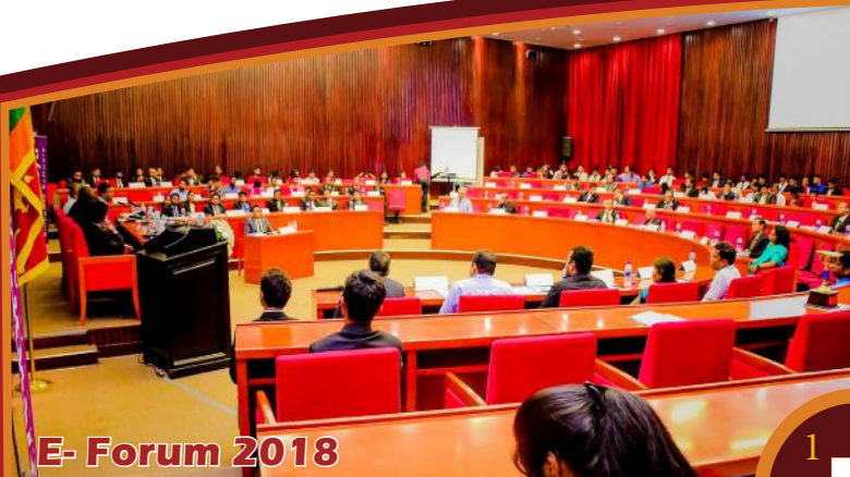
E- Forum 2018