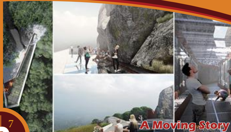
A Moving Story